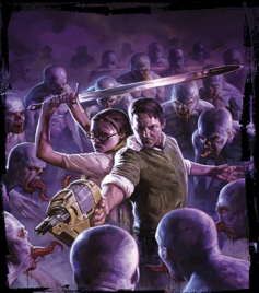
Face to face with bloodsuckers seeking their dear ones! COMING IN JANUARY: The Strain #10