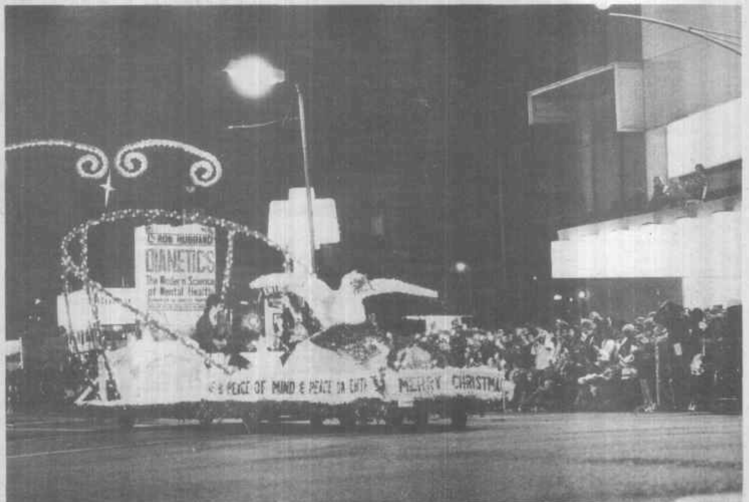
Internationally famous jazz pianist, CHICK CORE A and singer, GAYLE MORAN starred on the famous DIANETICS float at the annual Santa Claus Lane Parade on November 27. The parade was given national television coverage and an estimated 500,000 people lined the streets of Hollywood Boulevard.